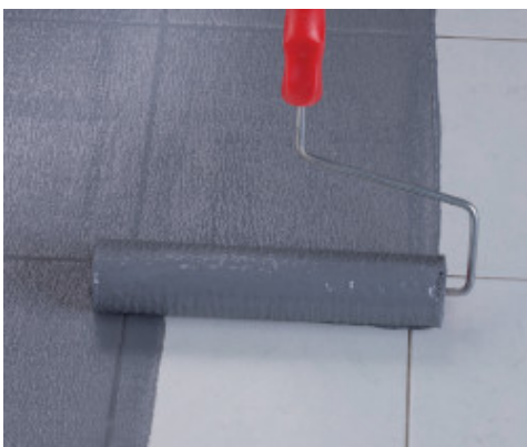
Application of Eco Prim Grip Plus by roller on existing porcelain tiles