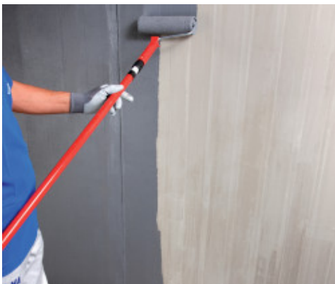
Application of Eco Prim Grip Plus on concrete by roller

If used as adhesion promoter for cementitious smoothing compounds on substrates treated with epoxy or polyurethane primers (such as Primer MF , Primer MF EC Plus , Eco Prim PU 1K , Eco Prim PU 1K Turbo ) without broadcasting of quartz sand, Eco Prim Grip Plus must be applied neat after complete drying and after max. 24 hours from the application of said primers. This type of application is possible in case of skimcoats of max. 10 mm and only if no application of hardwood is planned.