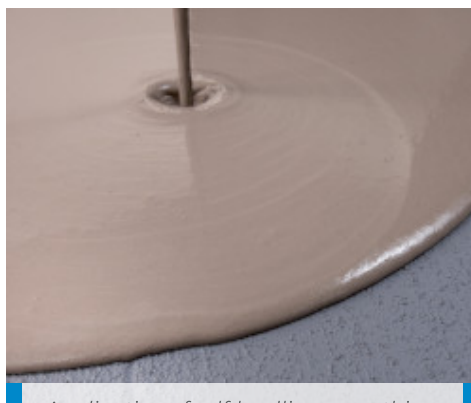
Application of self-levelling smoothing compound on dry Eco Prim Grip Plus on old floor