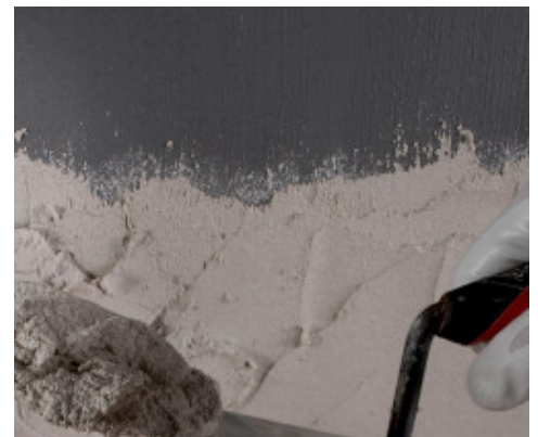
Application of render on Eco Prim Grip Plus