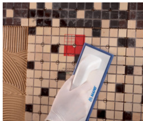
Pressing the mosaic down well and adjusting it into the correct position