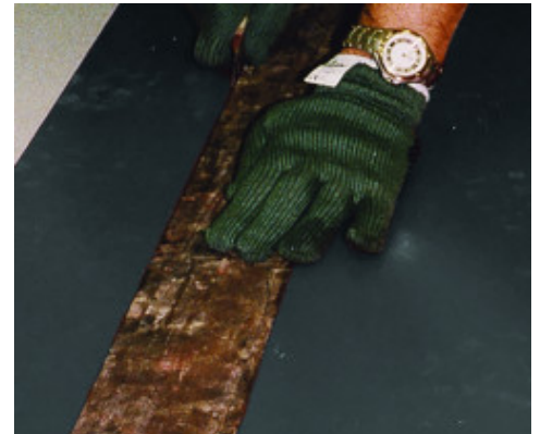
Cutting the joint between sheets of Mapelay