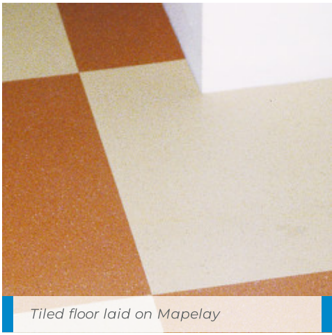
Tiled floor laid on Mapelay