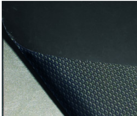
Overlapping adjacent sheets of Mapelay