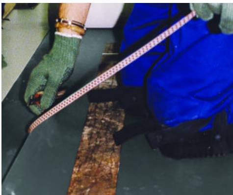
Removal of the cutted portion of Mapelay