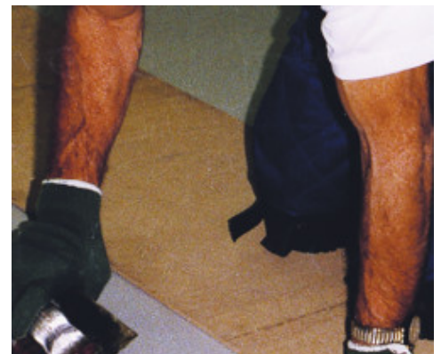
Smoothing the floor; avoid imprints by kneeling on a rigid panel