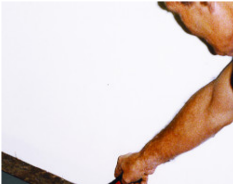
Laying Mapelay and formation of a 5-10 mm joint in correspondence with the constraints of the floor

ANY ALTERATION TO THE WORDING OR REQUIREMENTS CONTAINED OR DERIVED FROM THIS TDS EXCLUDES THE RESPONSIBILITY OF MAPEI.